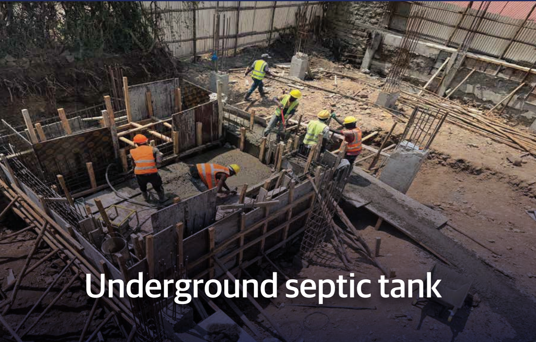
Underground septic tank