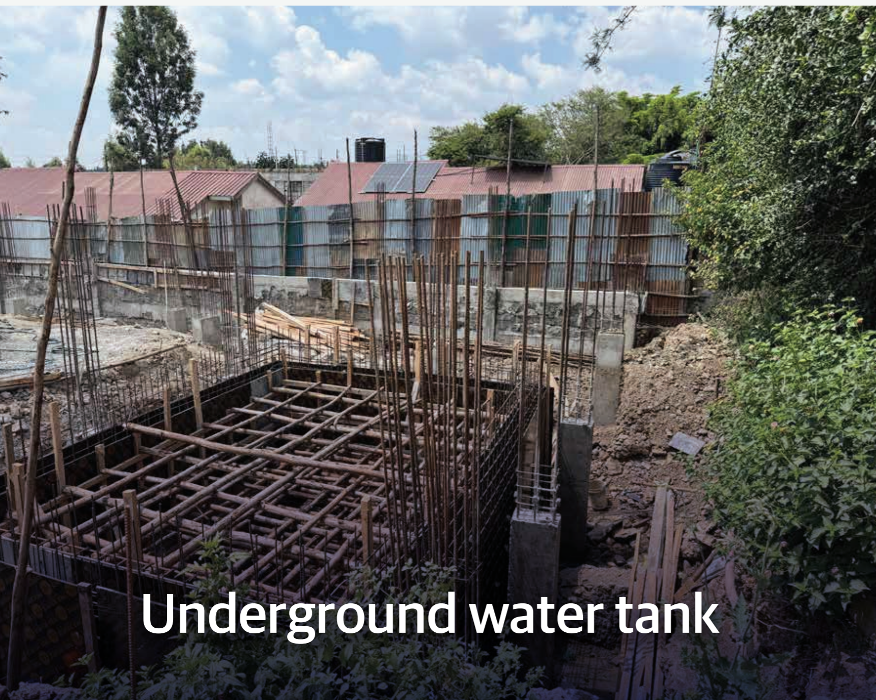
Underground water tank