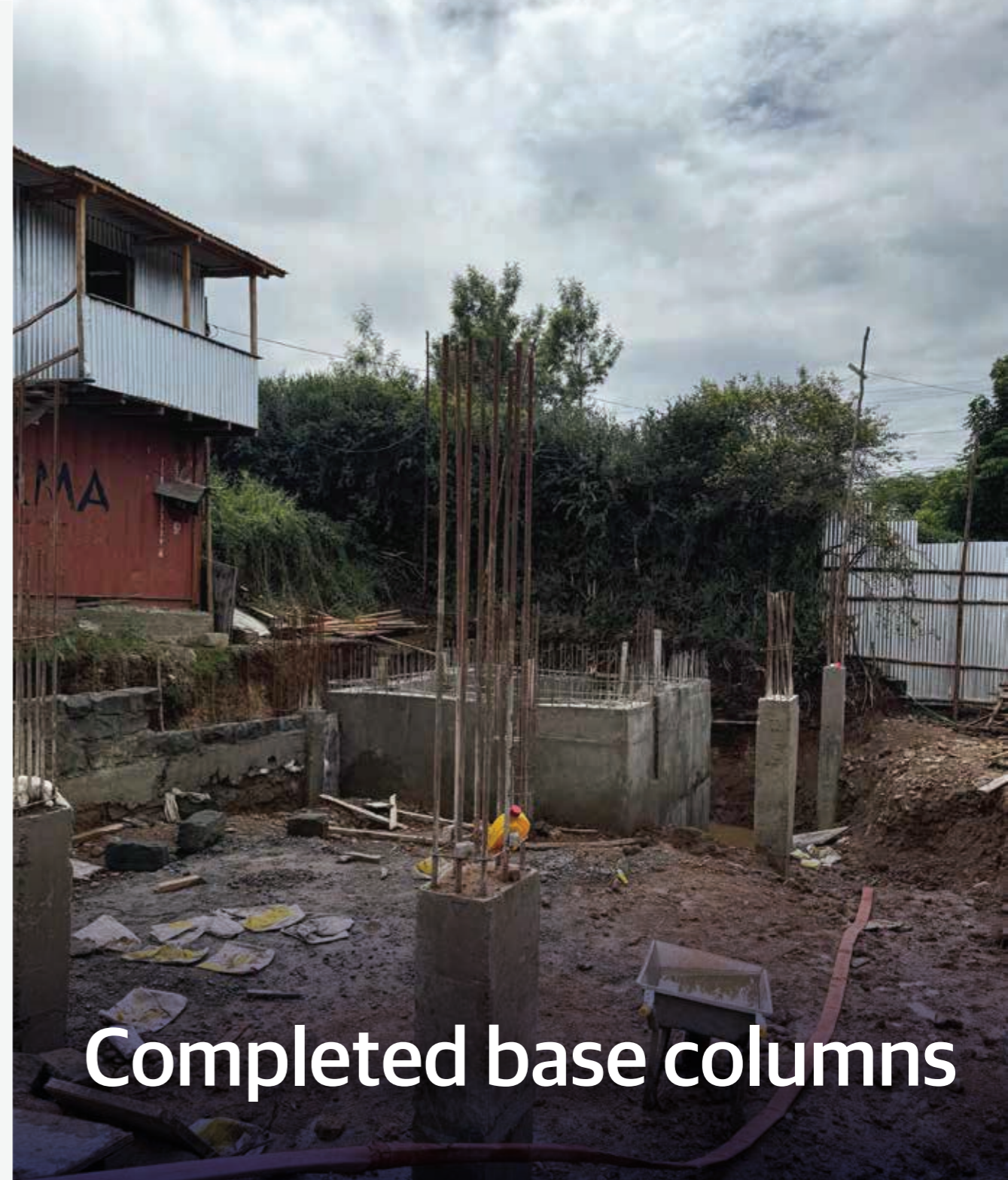
Completed base columns